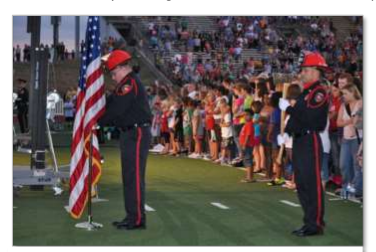
Joplin, MO—"I am Joplin" a community-led event created to bring together school aged children and their families prior to the start of school after the tornado in May 2011.

Use resiliency building in advance, in schools, & with parents. Early intervention following a