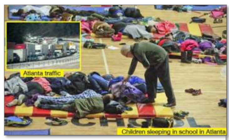
Atlanta GA 2014 ice storm

Ensure emergency services communicate with media. Media during the tornado focused on personal stories. What we needed was getting traffic around the city and making sure we were able to get out.