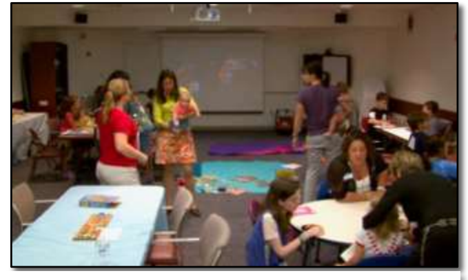
Pediatric Safe Area- converted conference room